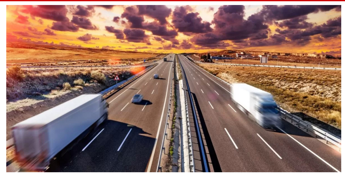
[Ref - Construction World]